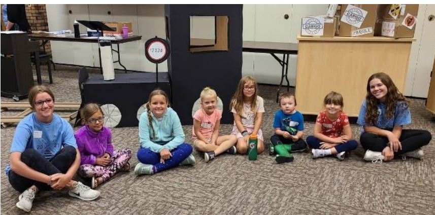
(Small group photos)